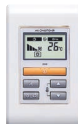
UTY-RSNYN Simple Wired Controller

*Optional Communication kit (UTY-TWBXF1) is required