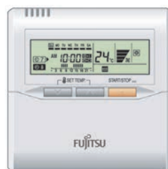
UTY-RNNYN Wired Remote Controller