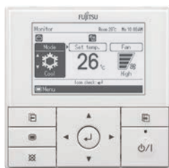
UTY-RVNYN Backlit Wired Remote Controller (High Grade)